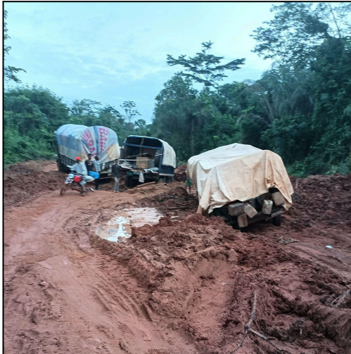
Figure 2: Road block in Liberia due to muddy roads

A decentralized model of oxygen production is being utilized in Liberia. The redundancy of many small PSA plants eliminates transportation time and logistical issues which may be prevalent in a centralized model. Liberia's road conditions represent their largest barrier to oxygen as many sites were separated by long distances and sometimes impassable roads. During the rainy season, road blocks due to tipped or stuck trucks are common and round-trip travel times to the previously used centralized PSA plant often surpassed 12 hours. These conditions are dangerous for drivers and make deliveries extremely unreliable – potentially leaving patients without oxygen for extended periods of time.