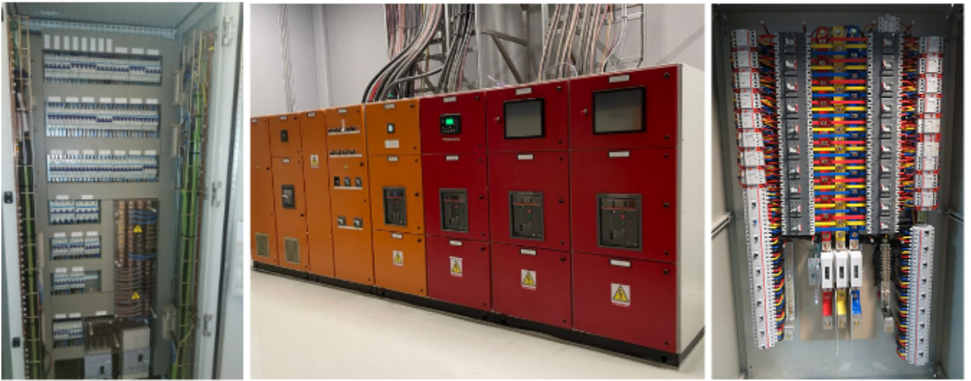
Figure 6: Well-constructed enclosure examples from BHI's work