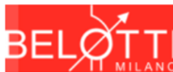
Figure 9: Internationally recognized brands that produce AVRs